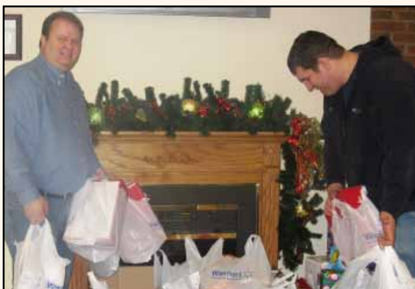
Lots of food and toys were donated last year.

As a not-for-profit organization, the Cooperative refunds money as long as it is fiscally responsible to do so. Until a specific year is "retired," the money is used for maintenance of the electrical system, and to allow Piedmont to meet the financial requirements of our lenders.