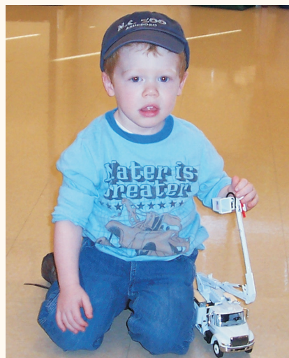
This young man enjoys playing with the toy Piedmont Electric bucket truck his parents won during Roxboro's Personality Day.