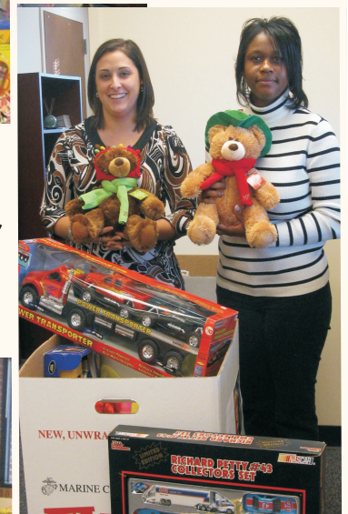
Thanks to everyone who helped make the 2010 Food & Toy Drive successful. Donations came from employees, members of the Cooperative and the community.