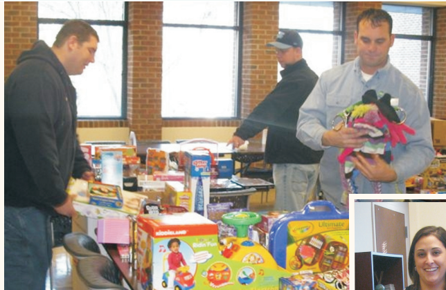
Piedmont Electric employees were Santa's elves during the holidays as they gathered and donated items for the annual Food & Toy Drive to help less fortunate neighbors in Caswell, Orange and Person counties.