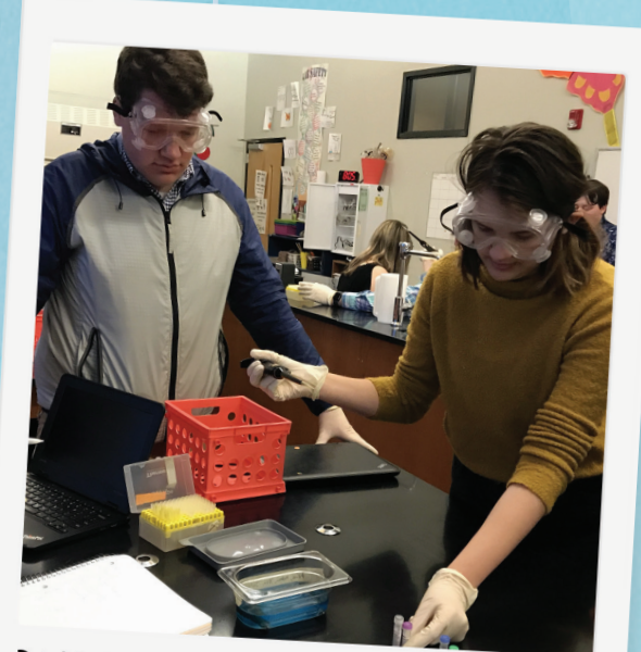
Bright Ideas Education Grant project 'Creating Savvy Student Scientists' at Roxboro Community School