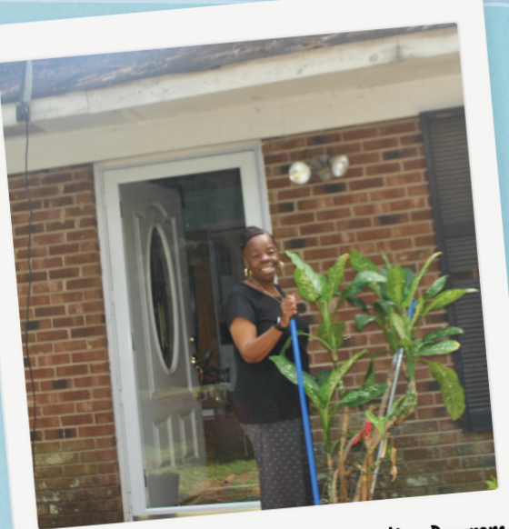
Habitat for Humanity's Home Preservation Program