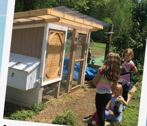
Bright Ideas Education Grant project 'Chickens in the Lower School' at Carolina Friends School