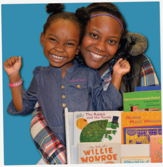
Book Harvest's 'Books on Break' Program at New Hope Elementary