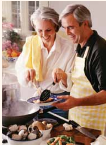
Make sure all appliances and their cords are safe to use to avoid the potential for fire.

❖ Stairs: Make sure there's proper lighting on and around stairways. Examine handrails and steps for possible defects or weaknesses, and test stair coverings for possible tripping hazards.