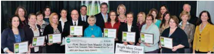
Several of Piedmont Electric's grant winners honored on November 15.

Piedmont Electric honored teachers' innovative ideas in November, awarding 28 Bright Ideas Grants, totaling $25,360, to local teachers in the six county service area. Each grant was awarded for innovative, hands-on classroom projects that otherwise would not have been funded. If you are a teacher interested in applying for next year's grant, please visit www.pemc.coop . The application will be available in April.